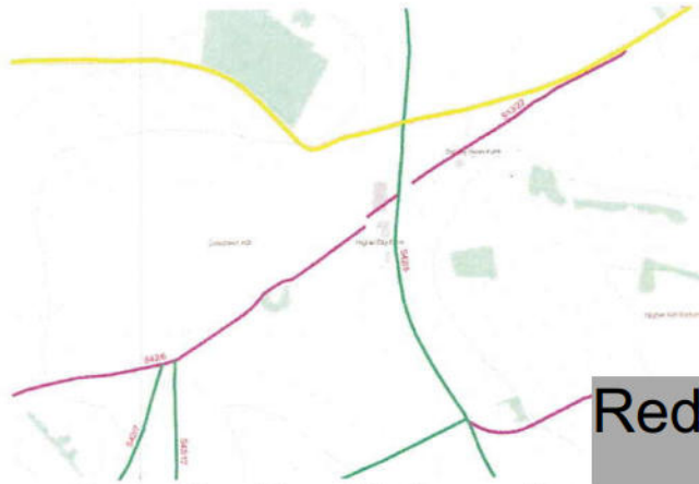
Extract from Dorset Explorer on line 1